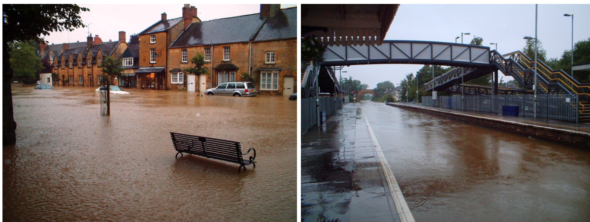
Figure 1 Examples of the vulnerability of infrastructure to flooding: a flooded road and railway station

Flood damage is influenced by a variety of factors, such as the water level, duration of flooding, the precautionary and preventive measures employed and degree of early warning received. Claims experiences that are systematically collected and analysed can support necessary risk management decisions.