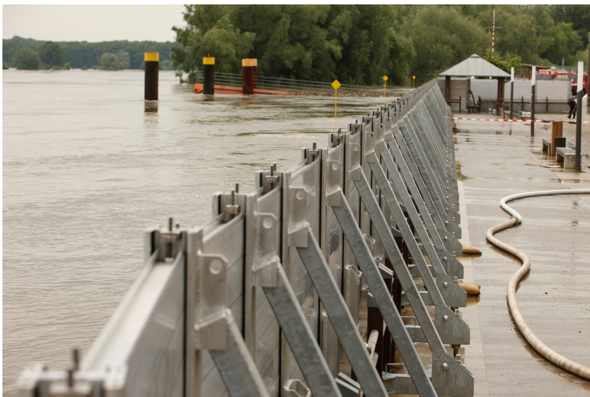
Figure 5 Example of use of a demountable flood protection wall

The responsibility of local and technical protection measures are generally controlled by the public administration, such as local municipalities