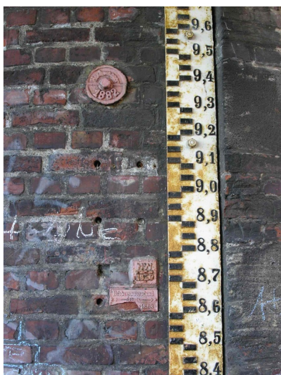
Figure 3 Example of historic flood marks