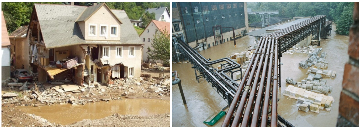
Figure 2 Examples of flood damage to residential buildings and in an industrial plant

The great flood in the catchments of the Elbe and Danube in August 2002 in Germany caused total economic losses of around EUR 11.6 billion. According to the experience of insurers currently in Germany a comparatively small number of major losses caused a significant proportion of the total damage. The largest single loss so far in Germany as a result of flooding occurred in summer 2010 at a manufacturer with a total damage of approximately 100 million €